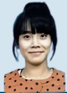
Ms.Jolin China Desk